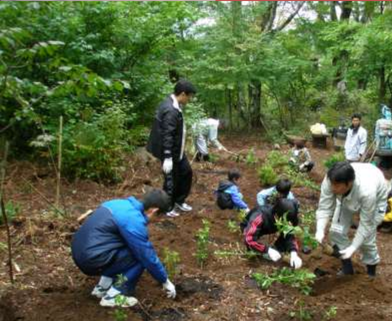
Planting and managing forest Ishizuchi forest school(NGO)