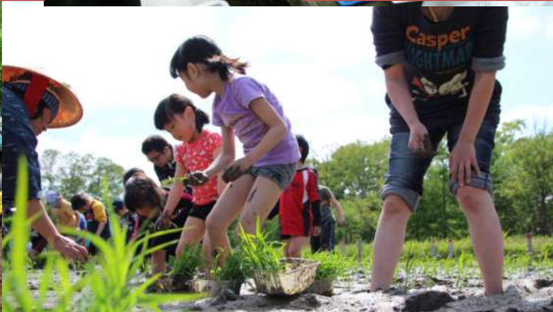
Environment education at Rice paddy fields Aleph-inc(company)