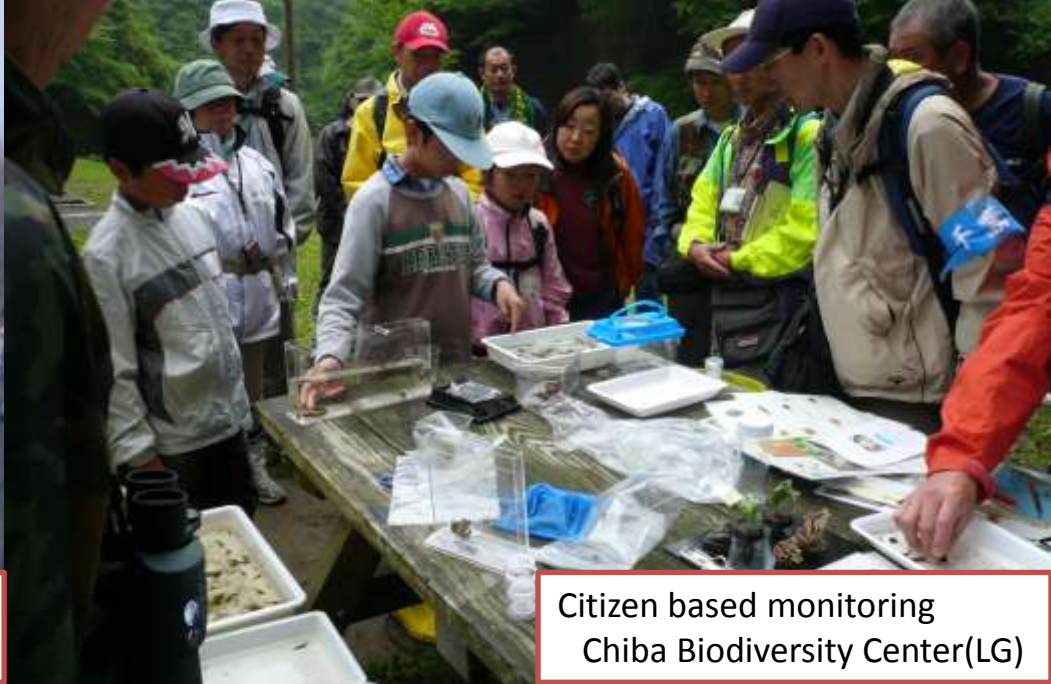
Citizen based monitoring Chiba Biodiversity Center(LG)