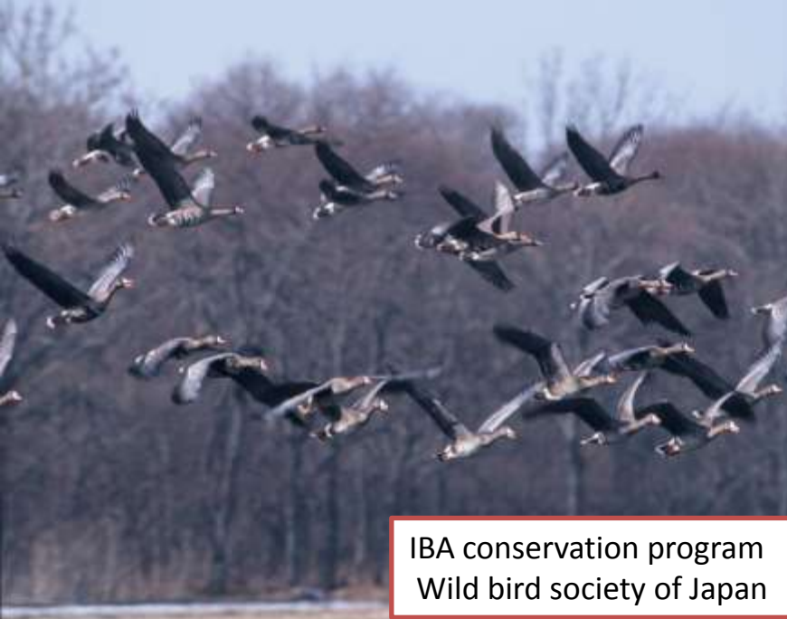
IBA conservation program Wild bird society of Japan